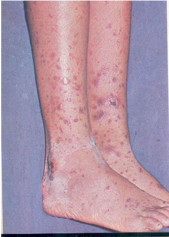
Fig. 1. Rash of DF. (Reproduced from Wattal C, Gupta PS, Datta S. Dengue fever and encephalitis. In: Khardori NM, Wattal C, editors. Emergencies in infectious disease. From head to toe. Delhi [India]: Byword Books Private Limited; 2010. p. 41–8.)

or ecchymoses may be noted in approximately one-half of patients with DHF and manifest as positive tourniquet test, easy bruising, and bleeding at a venipuncture site. Gastrointestinal bleeding (15%–30%), metorrhagia (40%), and epistaxis (10%) are also seen in some cases. 62 Convalescence in DHF is usually short and uneventful with overall case fatality of 1% to 5%. 45